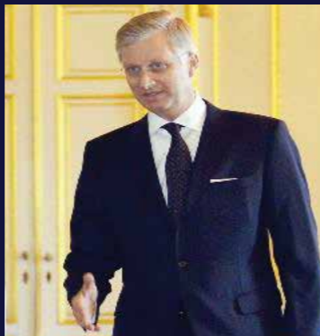
King of Belgium meeting privately in Bangkok, Thailand with Baron Point