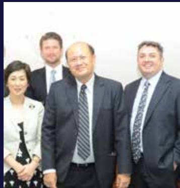
World Bank-MIGA CEO and Ministry of Finance, Thailand, Director-General