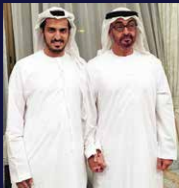
Crown Prince of Abu Dhabi H.H. General Sheikh Mohammed bin Zayed Al Nahyan