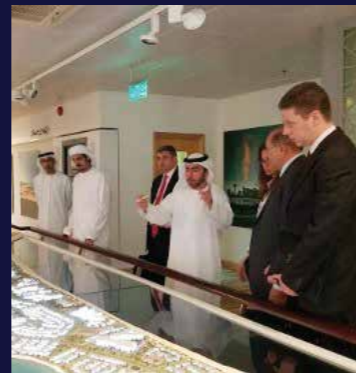
Tourism Development & Investment Company (TDIC) of Abu Dhabi, CEO