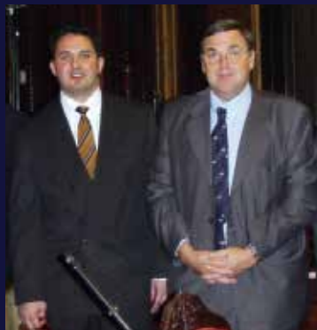
Chairman of le Sénat Ruling Party, Belgian Federal Parliament Upper House Chambers