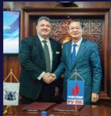
PetroVietnam Oil Memo Of Agreement for Bonded Tank Development Signing