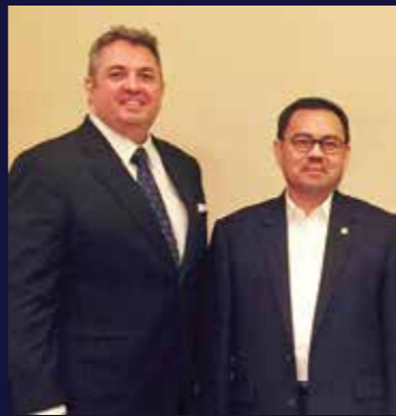
H.E. Said Sudirman, Minister of Energy & Mineral Resources, Republic of Indonesia